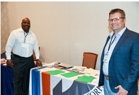
D. Smith Financial, Corp