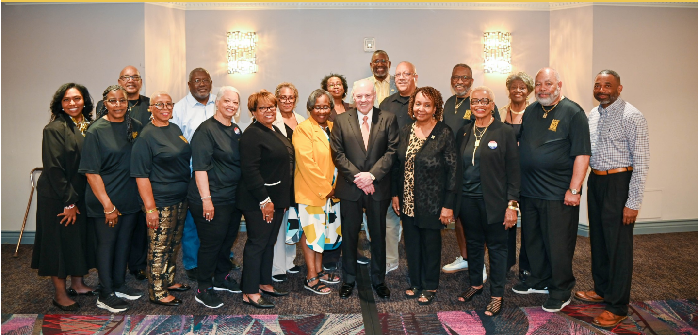
PMG Louis DeJoy and the 2022-2024 A-PLUS National Executive Board

His participation reaffirmed the importance of leadership, vision, and strategic planning in shaping the future of the Postal Service. We thank PMG DeJoy for his time, leadership, and dedication to USPS employees and stakeholders nationwide.