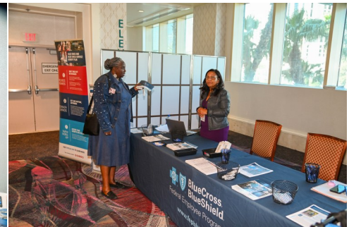
Blue Cross Blue Shield