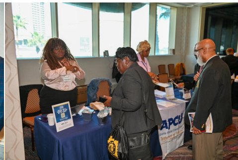
Atlanta Postal Credit Union