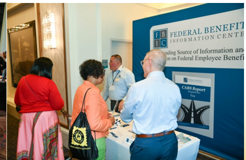
Federal Benefits Information Center